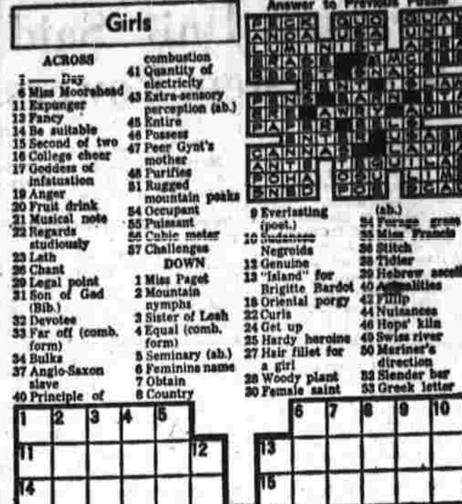
DAILY CROSSWORD PUZZLE