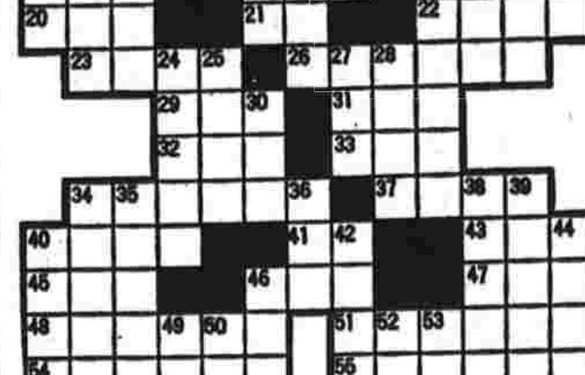
DAILY CROSSWORD PUZZLE